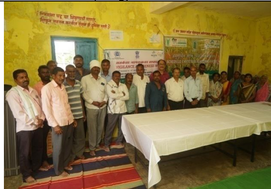
Gram Shabha programme at Sillori village, Nagpur