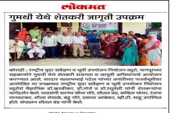
Gram Shabha programme of village Gumthi, Nagpur in media, Lokmat.