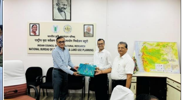
Prize distribution at HQs for Debate Competition.