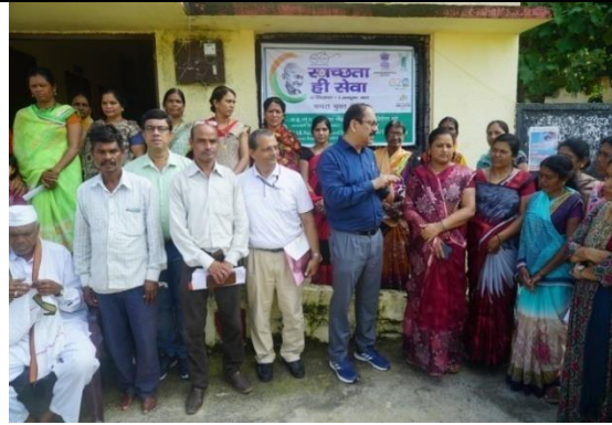
Vigilance awareness on swachhata at Gram Shabha Gumthi, Nagpur.