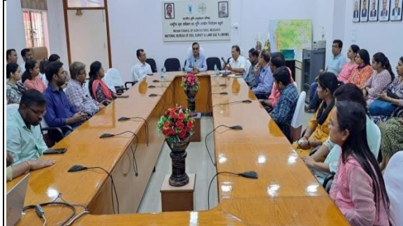
Concluding session at HQs chaired by Director and attended by all the staff at HQs Nagpur and Trainee Officers.