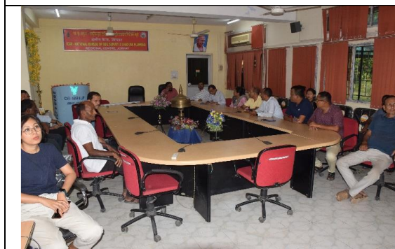
Jingle play at RC Jorhat