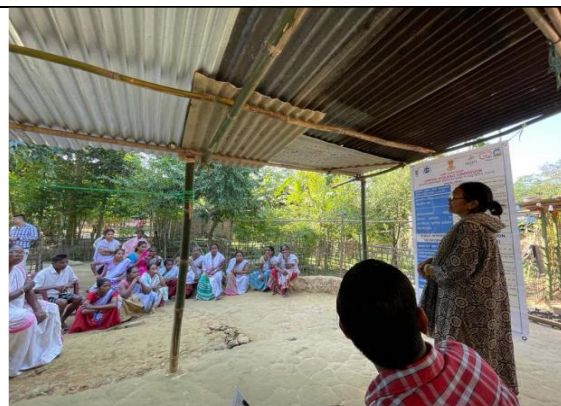
Gram Sabha programme at Kaliapani Chapori village of Teok, Jorhat