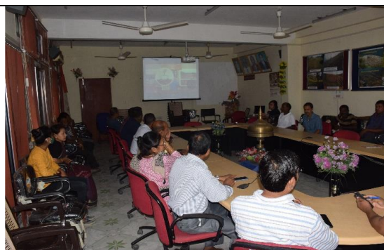
Video play at RC Jorhat