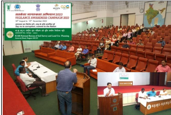
Debate Competition at HQs, Nagpur