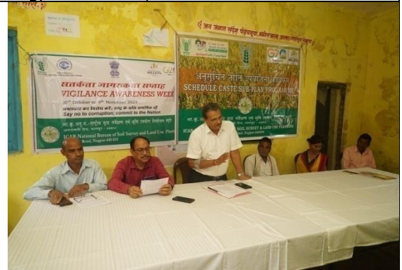
Gram Shabha programme at Sillori village, Nagpur