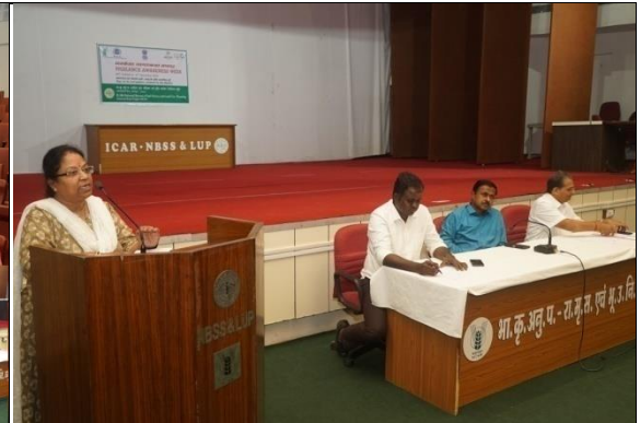
Debate Competition at HQs, Nagpur