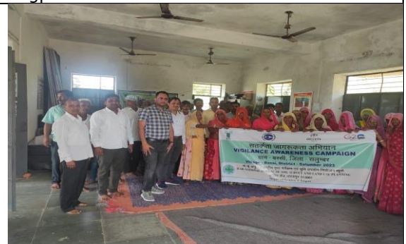
A chetna rally with farmers including farm womens during the Gram Shabha programme at Bassi village of Salumber district, Rajasthan.